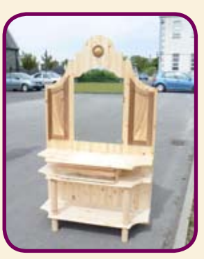
ART PROJECTS IN SANCTA MARIA